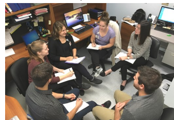
GMH team during their RI Huddle Examples of these strategies include:

identified 90 min/day as an incremental step towards achieving the provincial target of 180 min/day. When a patient's RI is not meeting this incremental goal, the team identifies ways to increase intensity.